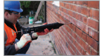
5. Insert a further bead of HeliBond over the exposed HeliBar, finishing 12mm from face and 'iron' firmly into the slot using the HeliBar Insertion Tool