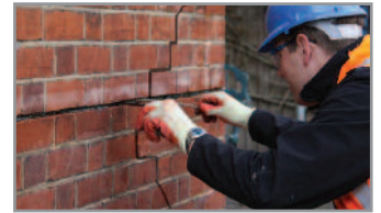
4. Using the HeliBar Insertion Tool push one HeliBar into the grout to obtain good coverage. Then repeat steps 3 and 4