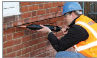
3. Using the Helifix Pointing Gun, inject a bead of HeliBond along the back of the slot