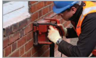
1. Rake out or cut slots into the horizontal mortar beds as specified