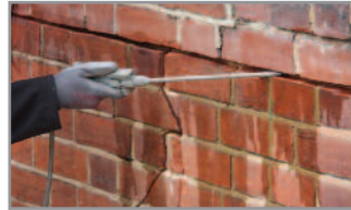
2. Clean out slots and flush with clean water and thoroughly soak the substrate within the slot