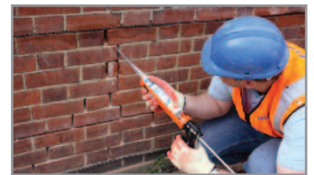
6. Re-point the mortar bed and make good the vertical cracks with CrackBond TE