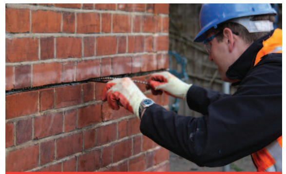
HeliBar is inserted into HeliBond grout within a cut slot. Used in pairs to form a masonry beam (Helibeam)