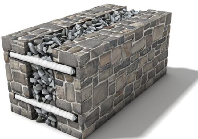
Stabilising a cracked rubble-filled wall.

Rubble Filled Walls are an extremely variable construction type to work on. They are often 100 years old or more; and suffer from multiple defects such as delamination, cracking and bulging. It is often essential to provide a reliable fix across the full thickness of the wall to extend its serviceable life. SockFix anchors allow grout injection to be controlled when used as an anchor through the full thickness of the wall; including through voided sections of rubble fill. On site testing can be carried out to ensure that effective adhesion is being achieved into the inner and outer leaves of the rubble filled wall. Plates can also be used where necessary in poor substrates.