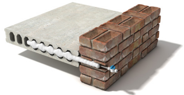
Securing an external wall to a hollow concrete floor slab.